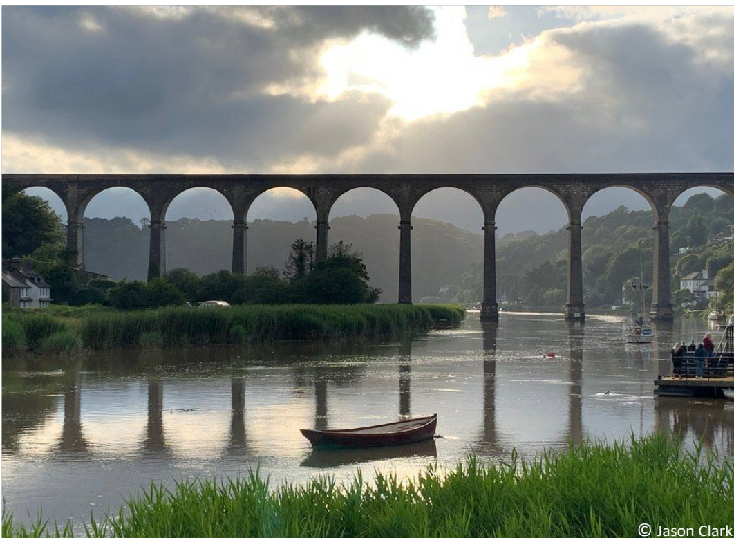
Beside the River Tamar in Calstock, Cornwall